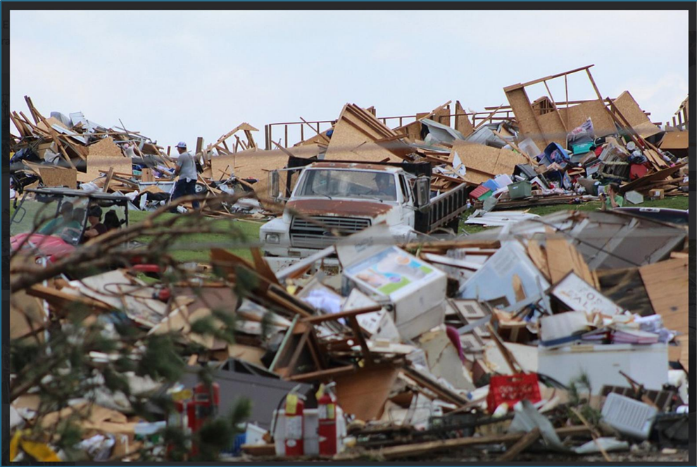
Photos of Linea Screen damage